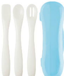
Part No. KJ3263

Package include: 3 spoons, 1 portable case