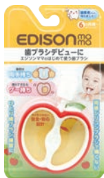
Part No. KJ1253