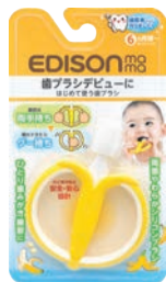
Part No. KJ12532